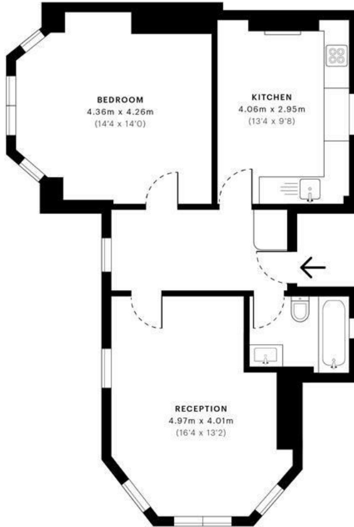
- Second Floor

GROSS INTERNAL AREA (GIA) The footprint of the property 57.62 sqm / 620.22 sqft